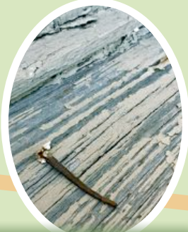
Picture this!--muddling around the site turns up what looks to be an authentic Cumberland Iron Works NAIL!

Home of the City's original startup industry, it makes a pretty good metaphor for the heart of Bridgeton. Maybe we can all get it beating again!?