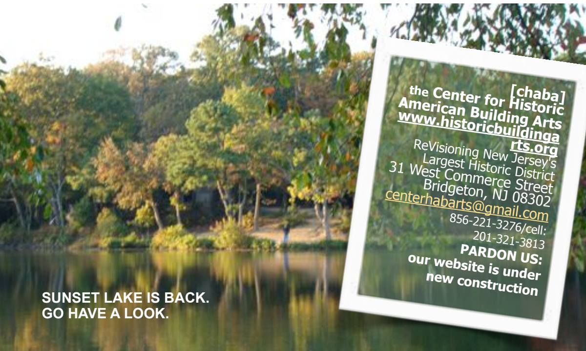
SUNSET LAKE IS BACK. GO HAVE A LOOK.

LESTER BROWN RETIRES: Shortly after "Bringing Sustainability Home" to his own hometown of Bridgeton last October, world renowned environmentalist Lester Brown announced his retirement and the closure of operations at the Earth Policy Institute--one of many environmental policy thinktanks he has created over his incredibly productive lifetime. We at CHABA are grateful to have enabled his homecoming at CHABACON 2014 and hope we may enjoy his future participation in some of our educational activities. Brown's latest book, The Great Transition, is the ultimate challenge to us all, but especially those of us in South Jersey, to think freshly and forwardly about what it means to have sustainable energy in a sustainable urban community within a richly endowed and historic land and seascape. More about Lester Brown's Bridgeton appearance on the CHABA website , with a link to his talk on YOUTUBE!